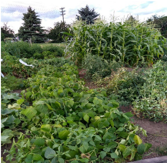
North Bailey's Lake Garden

SEND US YOUR APPLICATION TO START GROWING YOUR OWN HEALTHY PRODUCE!