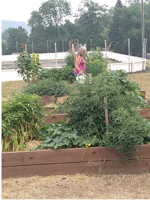
Northside Jefferson Park Garden

SEND US YOUR APPLICATION TO START GROWING YOUR OWN HEALTHY PRODUCE!